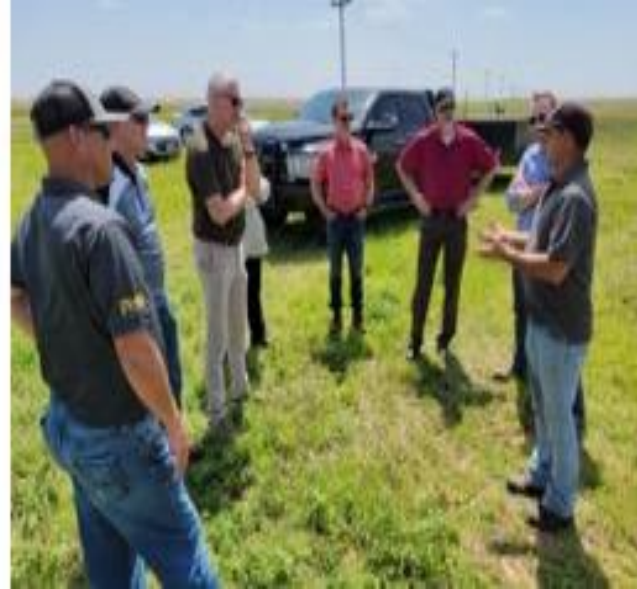
June 2022 FDA Wheat and Mill Tour